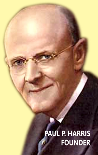
PAUL P. HARRIS FOUNDER